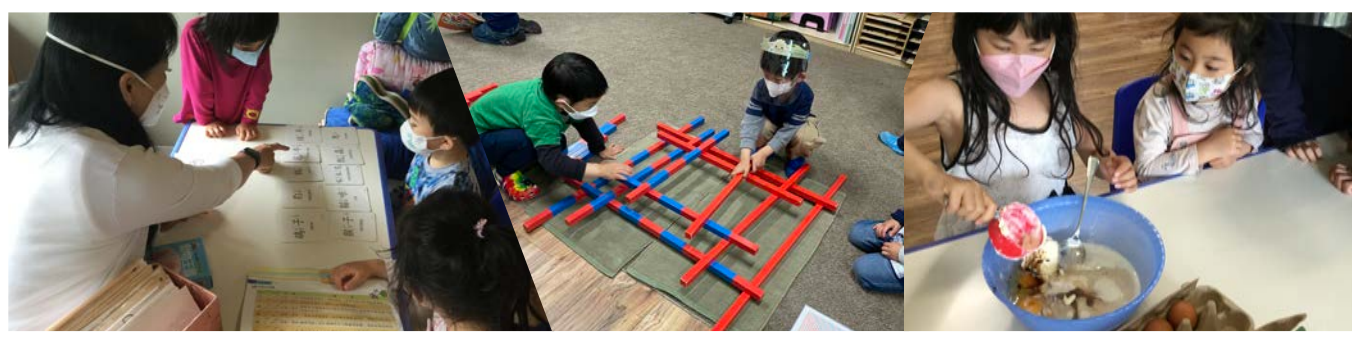
Science and Geography

We will learn to take shoes on and off, sewing cards and how to brush fingernails.